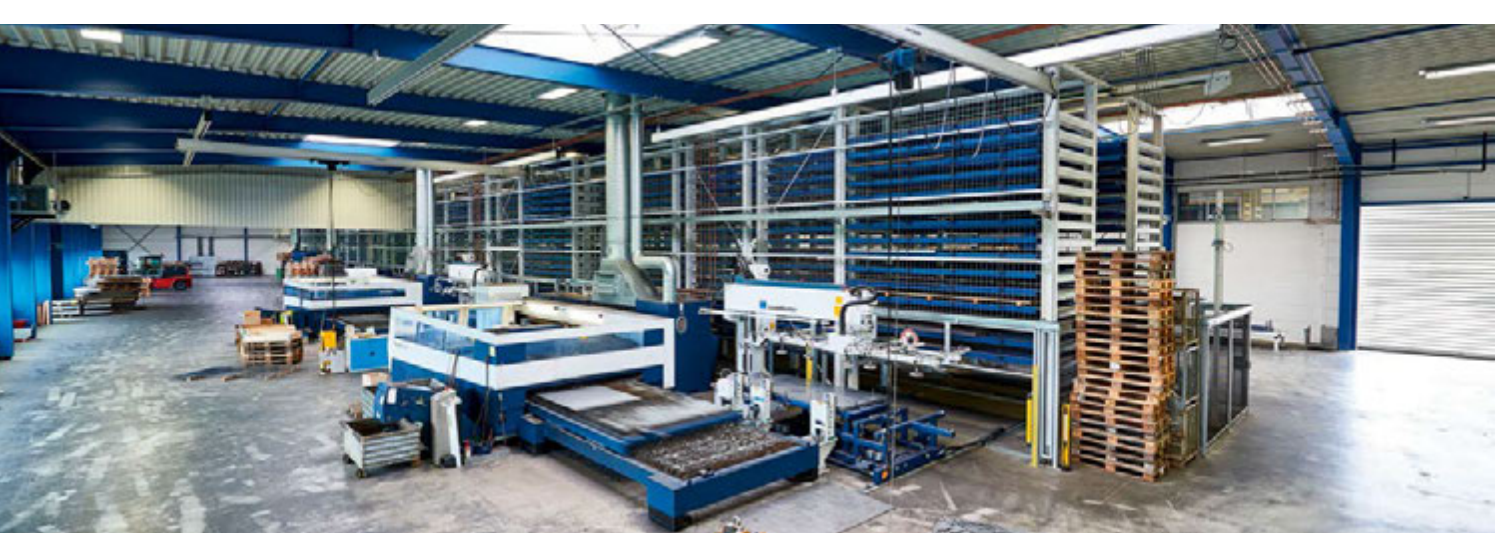
Dreeskornfeld has invested in a second automatic sheet storage system, which is designed for four system pallet sizes, including XF, the largest possible format.

The sheet metal processor Dreeskorn-feld operates two STOPA UNIVERSAL automatic storage systems in order to permit the provisioning of its extensive range of materials. One of the systems is designed for four sheet sizes, including the largest XF format. The fact that the stores are connected by a passageway at a height of five metres means that any of the laser cutting systems can be supplied from both of the systems.