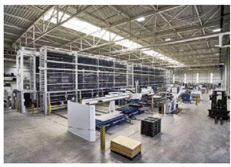
At BINDER, the STOPA COMPACT II sheet metal store acts as the internal logistics centre.

At BINDER, a specialist in the field of simulation chambers, an automatic STOPA COMPACT II sheet metal storage system forms the basis for a forward-looking sheet metal production plant. The aim is to maximise automation on the basis of the storage system, which will act as the internal logistics centre. Among other things, the operator benefits from reproducible processes, high-quality manufacturing and unstaffed night shifts.