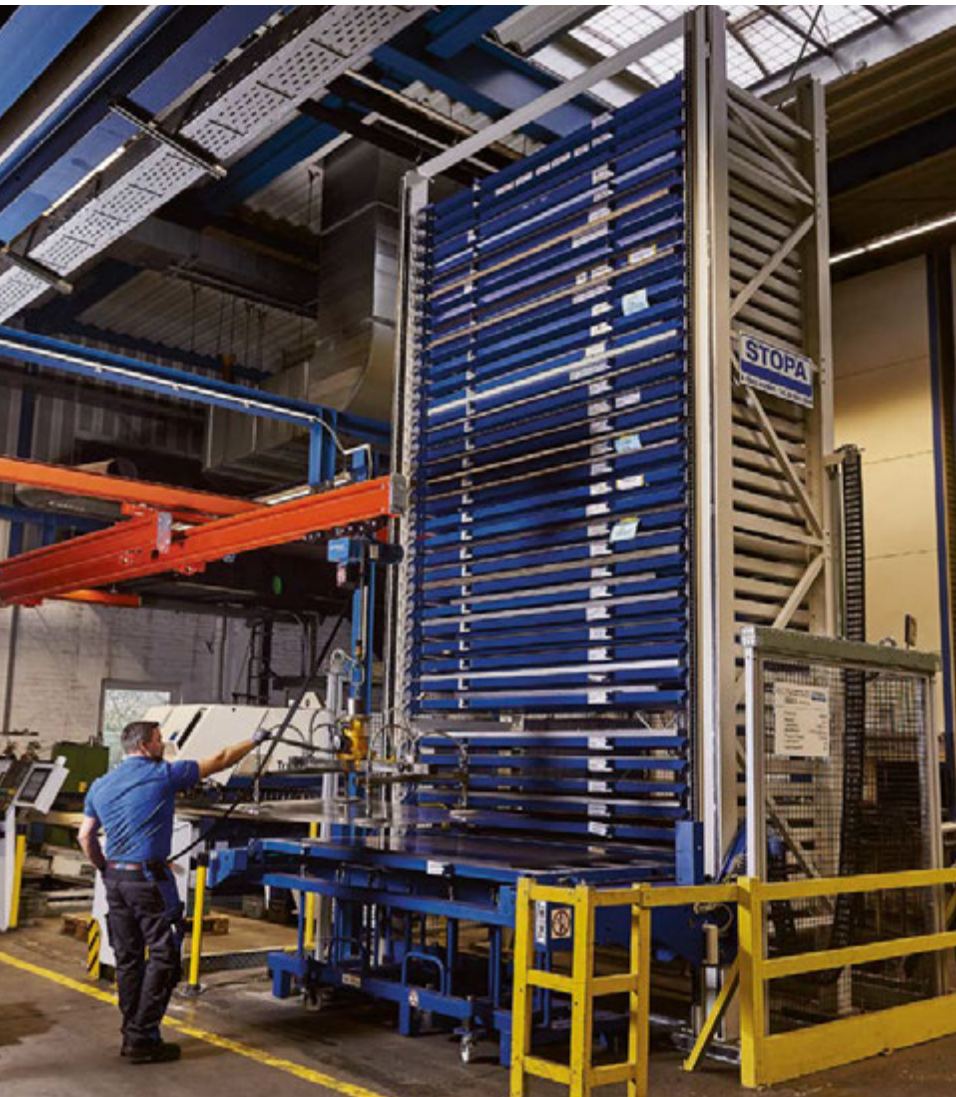
The operator makes the system pallet exit the tower and then lifts the metal panels ergonomically using the crane.