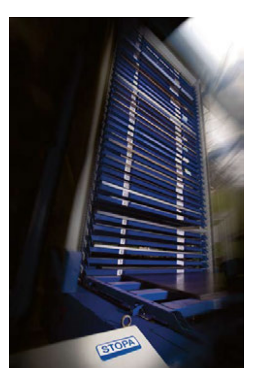
Since Winkhaus processes sheets weighing some 160 tonnes every year, its investment in this storage system is a step with an eye on the future.

By investing in a STOPA TOWER Eco Tower Storage System, Winkhaus, a German company which makes building fittings, has improved reliability when handling metal sheets, and so increased its efficiency. Other advantages include, for example, space-saving storage options, the ability to access blank sheets quickly, reduced material damage and a more orderly system.