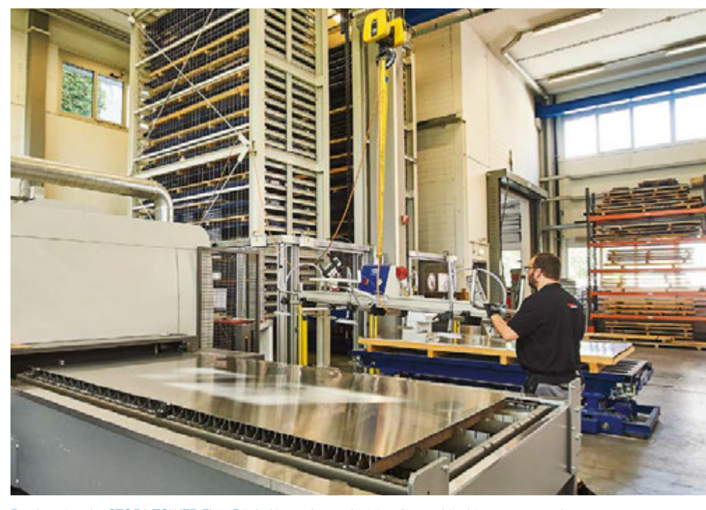
By choosing the STOPA TOWER Flex, Büchel has taken a decisive, forward-looking step towards increased economic efficiency.

The storage system developed by STOPA Anlagenbau GmbH in Achern-Gamshurst ensures an efficient use of space, faster access to sheets, improved organisation and careful material handling. In addition, the storage system is a vital prerequisite for process-optimised manufacturing, for which the flexible material provisioning of different sheet sizes and thicknesses is essential.