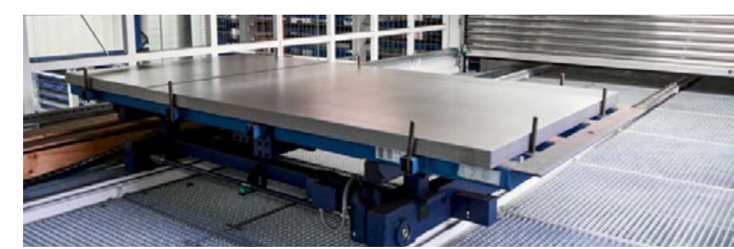
All the laser cutting machines can be supplied with material at any time from either storage system via the bridge-type passageway.