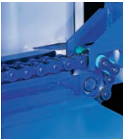
Maintenance free pallet transfer system