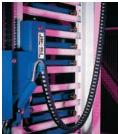
Optimized spacing between pallets guarantee highest capacity

The user friendly flat pallets with precision rollers guarantee optimal handling of your storage goods. The operating of the system is done from a central operating panel. Easy and safe operation is enhanced by the clearly arranged text display. During operation, each step of the transport sequence is displayed on the screen. The extensive safety functions guarantee a maintenance free operation.