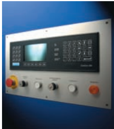
User friendly operating panel