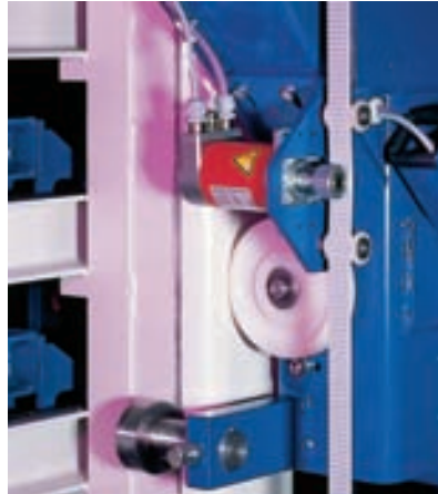
Height positioning system independent of load on crane