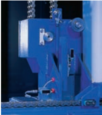
Elevator with duallink chain