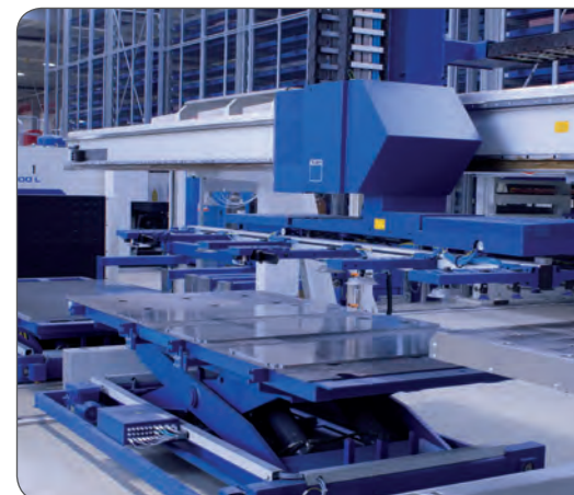
Two scissor lift tables supply the SheetMaster with sheets from storage.