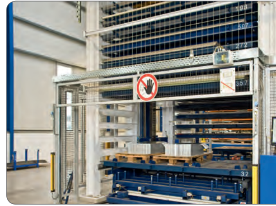
It is also possible to store europallets in stock thanks to a special mechanism that prevents slipping.