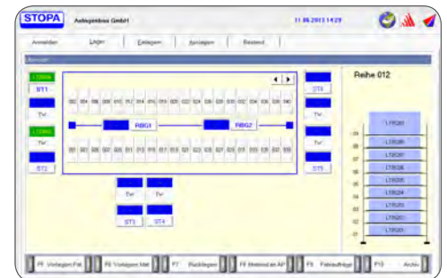
The clearly organized display simplifies operation.