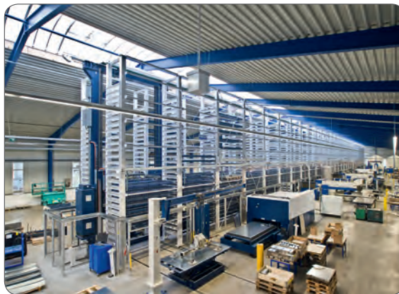
Machines interfaced with the storage system are provisioned with material on a just-in-time basis. This guarantees trouble-free production workflows.