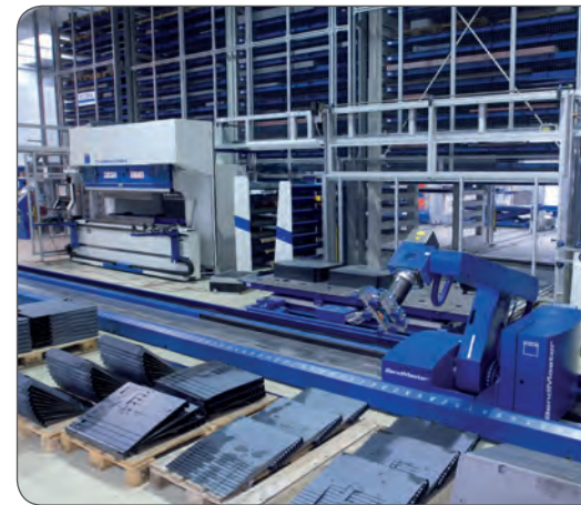
Machined parts can be returned to storage thanks to the direct interfacing between the bending machine and the storage system.

A wide variety of materials with differing formats, stacking heights and payloads are stored on special system pallets. The longitudinally driven storage and retrieval unit with telescopic forks extending on both sides performs handling operations while preventing damage to material, thus contributing to quality assurance.