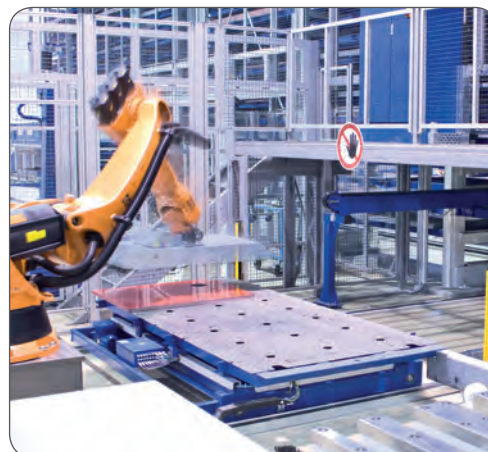
A robot takes previously stored, laser-machined parts from the scissor lift table for further processing.