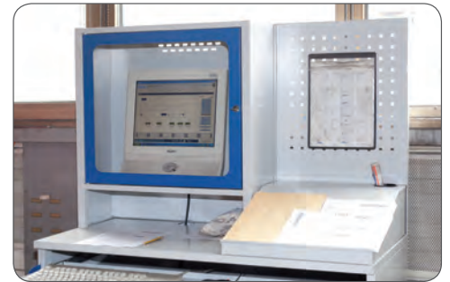
The customer provides the operating console and computer. STOPA implements the software.