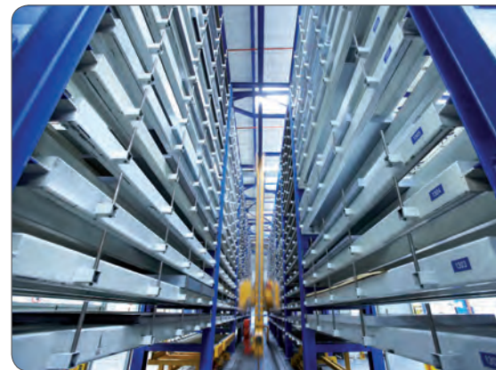
The STOPA UNIVERSAL storage and retrieval unit in use.